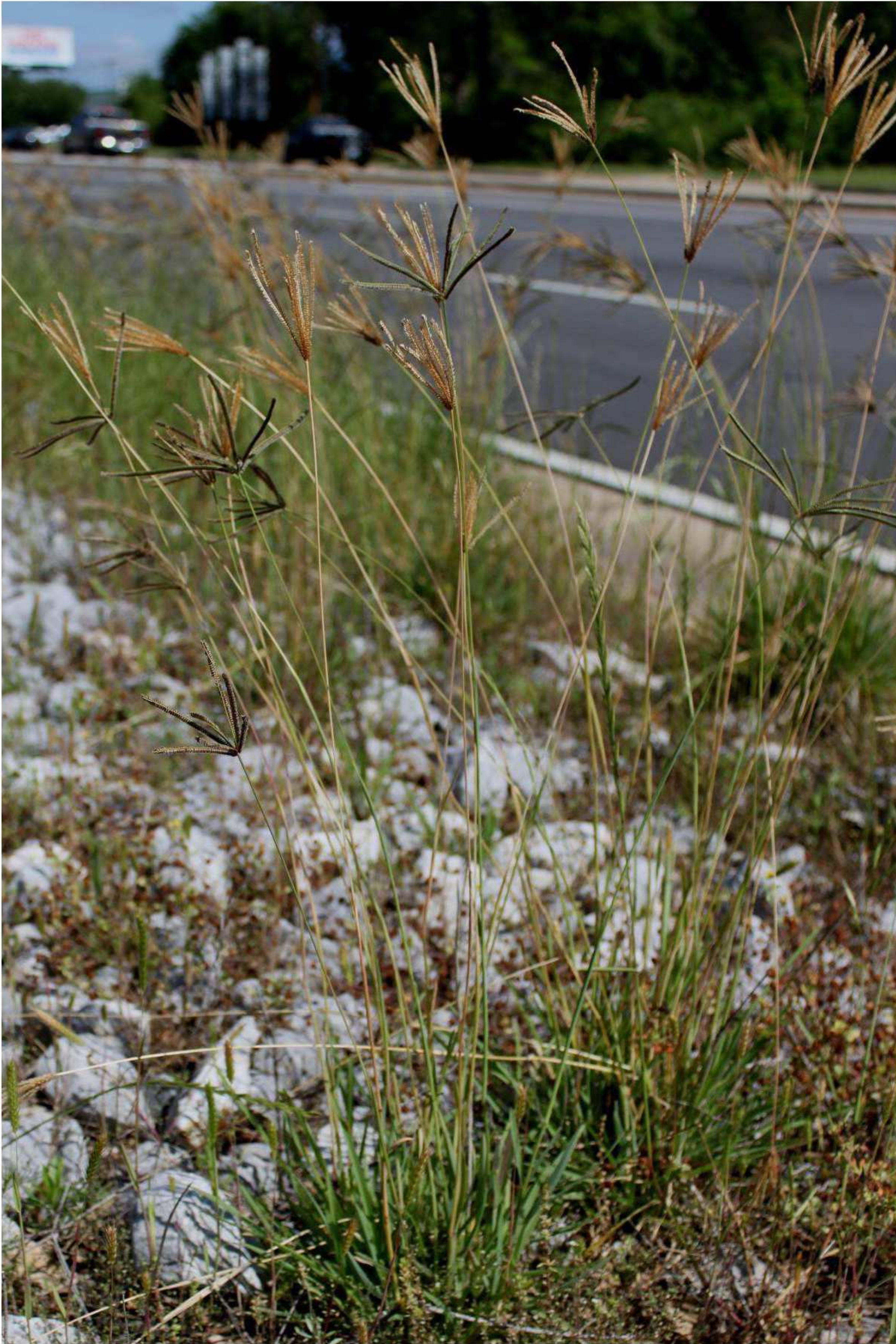
Figure 2. Eustachys caribaea (Poaceae).